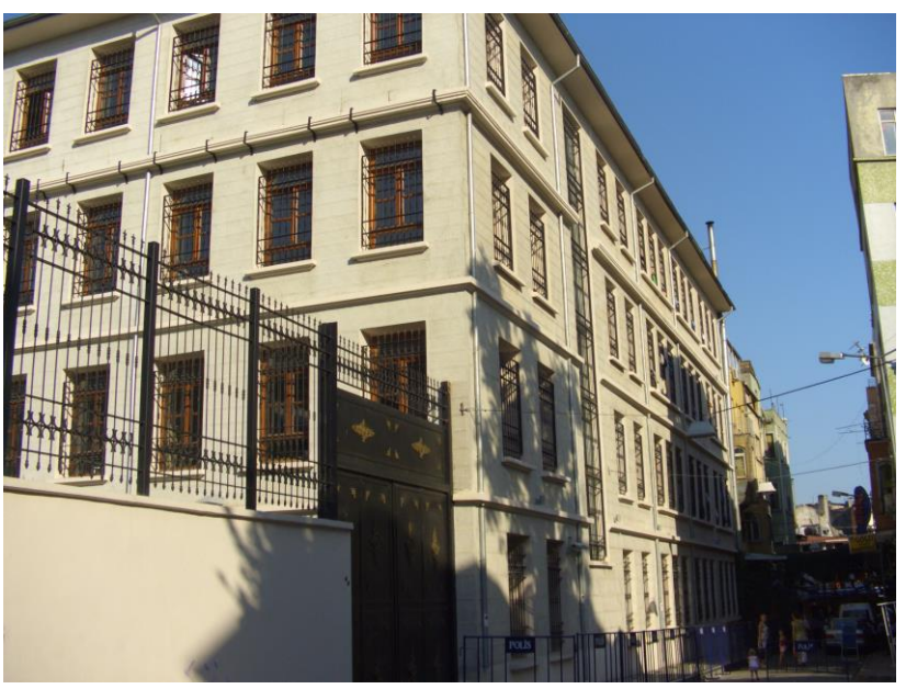
Figure 1 . Kumkapı Foreigners' Guesthouse.

The Foreigners' Guesthouse of the Police Headquarters is also located in this area, which is the starting point for the study. The guesthouse opened on 3 April 2007. The guesthouse building is on an enclosed land of 7,000 m2, and has a capacity of 600 beds; 400 for men and 200 for women. The building has a restaurant, lawyer meeting room and visitors room. The building has 3 floors; the first 2 floors are for men migrants and the top floor is for women.