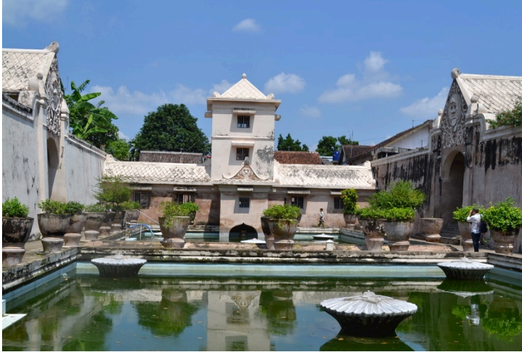
Figure 3. Tamansari or the Water Palace in Kraton complex.

The following photos show two examples of buildings protected by the current legislations. Figure 3 depicts Tamansari—located in Kraton (palace) complex.