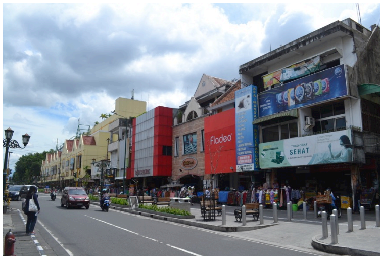
Figure 6. The current situation at Malioboro Street.

As explained earlier, the regulation of HC is followed up with urban planning and tourism policies. Kraton complex has been designated as conservation zone that allows tourism. In addition, Malioboro Street (the northern part of philosophical axis) and Kotabaru district is appointed as a commercial zone. Kotabaru district is a historic area located to the east of philosophical axis. Figure 6 depicts the current situation on Malioboro Street with many commercial buildings. The situation expresses a general issue of HC in Yogyakarta.