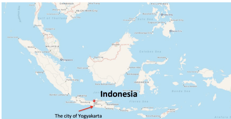
Figure 1. The location of Yogyakarta on Indonesia map. (Google Maps, 2019)

The city of Yogyakarta is located in the southern area of Central Java (see Figure 1). The currently reigning Sultan administrates the province as a governor. The province is comprised of four regencies (Bantul, Gunungkidul, Sleman, and Kulon Progo) and one municipality (Yogyakarta). The municipality, as the setting of this study, corresponds to the past embryo and the current urban area of the province.