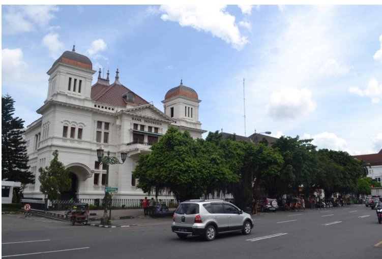
Figure 4. The Central Bank of Indonesia. (The first author, 2019)

Tamansari was built in 1765 and designed by Tumenggung Mangundipura and Demang Tegis (Wardani et al., 2013). This site represents traditional architecture and court antiquity. Figure 4 below presents a sample of colonial building with Indische style . This building was built in 1879 and designed by two Dutch architects—Eduard Cuypers and Marius Hulswit (Kurniawan, 2017). This building is one of a few heritage buildings in monumental scale located at the northern area of Kraton .