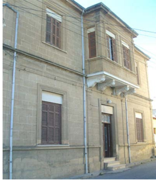
Figure 6. The house example in the British Colonial Period II