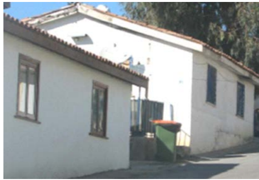
Figure 8. A typical house in Karadağ (Photograph by the Author, 2011)

The majority of the approximately 6000 persons working in the copper mine and their families lived in the CMC houses and in the immediate vicinity: Yeşilyurt ( Pendaya ), Doğancı ( Elye ), Bağlıköy ( Ambeligu ), Yeşilirmak, and, in 1936, even Lefkoşa. The workers had different religions (Christian, Muslim, Jewish) and different nationalities (most of foreigners at the rate of two percent were British, American, Armenian, and Jewish) and the natives lived peacefully in a multi-cultural environment while speaking in three languages (Turkish, Greek, English) among themselves. Urban life was supported with schools and sport areas (two primary schools belonging to Greek and Turkish communities, a secondary school and sports club in built in 1949, a