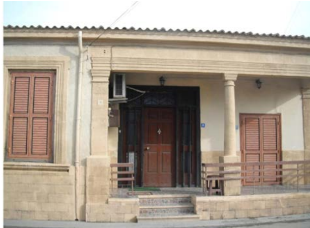
Figure 4. The modest house with stone facades