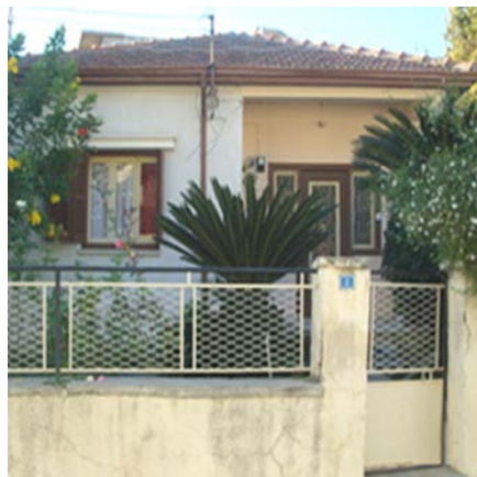
Figure 9. The house example in modern period

The use of industrial products (glass, iron, concentrate, etc.) in the houses of the British Period created plainer and more functional designs. Even if the art-nouveau ornaments had become widespread in the facade arrangement and a sense of design in which the human scale is important in the 1960s, they had been forgotten along with the traces of the past in the 1990s. Primarily, the majestic, garish, solid wood doors of the Ottoman and British Periods were minimized and the industrial product glass surface door wings, knobs, handles, and iron guardrails which were safer, lighter and easier to use were preferred. The window sizes were also reduced but wooden shutters were not waived (Figure 9). The same characteristics were followed in the detached houses with a garden. The same features were followed in detached houses with gardens, and were surprising effect in 1980s.