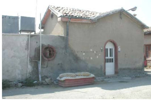
Figure 7. The house example in the British Colonial Period II

elevation differences in the indoor space of some houses, the connection between the rooms was achieved by one or two risers. In the backyard of every house, there was shed used as toilet and bath, an individual storehouse, and a well. These houses were constructed of masonry walls on stone foundations which were used only for these houses. The roofs which were wooden on the inside and covered with tile on the outside were convenient for the climate conditions (Figure 7).