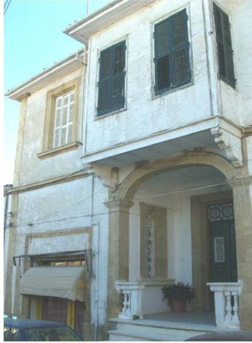
Figure 5. The house example in the British Period I (Photograph by the Author, 2011)

buildings. But the architecture of period was not pure due to the facade layout and complicated structure of patterns differing from the past. The houses of the first British Period I (1878-1925) are defined by their size and eclectic architecture created with exaggerated façade also door and window orname. In these houses, facade elements such as the oriel and floor/window moldings with reference to Ottoman Period and local architectural elements such as recessed entrance spaces or vaulted spaces were distinct (Figure 5).