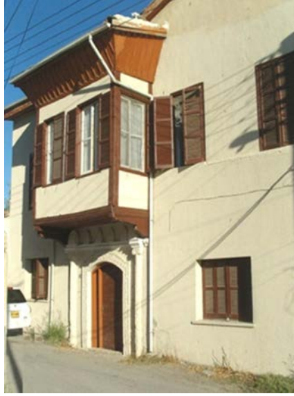
Figure 2. The mansion example in the Ottoman Period

external climatic effects, and a visual richness was brought to the texture (Figure 2).