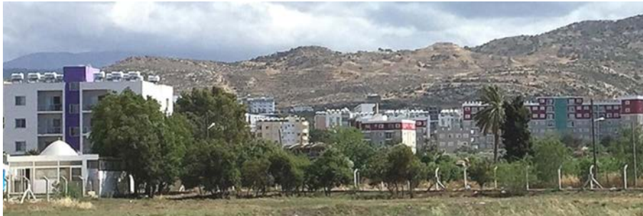
Figure 11. The new (modern) house in Gemikonağı

Around 2010, the multi-storey (ground+five and seven) dormitories and apartments began to quickly increase around the university, contrary to the settlement pattern, topography, climate, and silhouette of city (Figure 11). It is also thought provoking that these buildings were constructed by demolishing the citrus gardens.