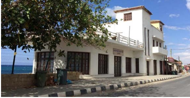
Figure 10. The art-deco style house on shore in Gemikonağı

The art-deco style houses shown in Figure 10 and the residential areas that began to be developed mainly on the coast of Gemikonağı and its immediate vicinity were for the residential needs of students, academics and other workers of The European University of Lefke with 1990s.