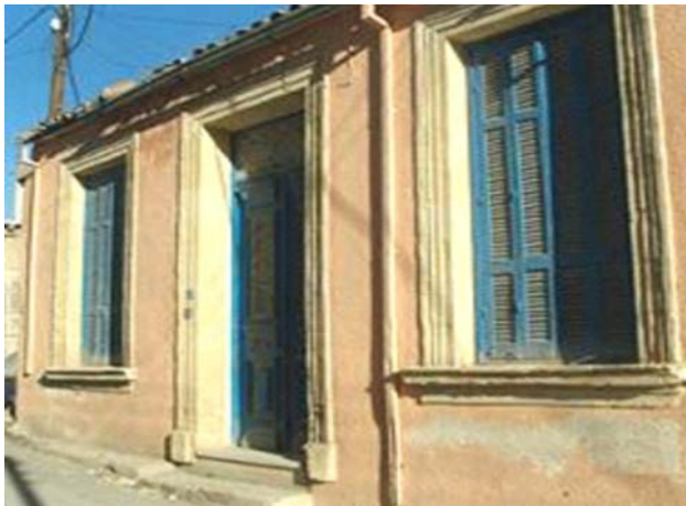
Figure 3. The modest adobe house

Thanks to the leniency of the Ottoman administration, the elites and the “haves” lived in the type of houses described above, the ordinary citizens in a more modest scale housing, and even groups of different origins and beliefs maintained their lives side by side on the same street. In this type of settlement and living accommodations, different residential buildings with a pure or alternating style were constructed between the center and valley consecutively in Lefke in different periods. The construction technique in both houses typology is adobe or rock-fill materials in the plasterboard and half-timbered (built-up) system and masonry between the wooden bases (Figure 3).