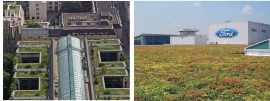
Figure 1. Examples of Intensive Green Roof (left) and Extensive Green Roof (right) (Gargari et al., 2016)

Although green roofing may help alleviate urban floods, reduce energy costs and improve environmental performance, their implementation is not so common (Zhang and He, 2021). Some study has focused on barriers in various countries with different climatic conditions and socio-economic position, while others have concentrated on other elements of GR installation. Barriers in the literature related to green roof installation are listed in the table below (Table 1).