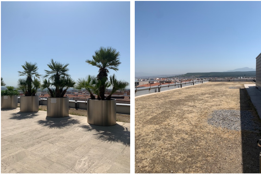
Figure 4. The Building of Municipality of Gazimир

Each municipality has a different department related to green roof projects. The interviewees were chosen from a variety of backgrounds such as architecture (7), landscape architecture (1), urban planning (1), and engineering (3) with varying levels of experience or no experience with a green roof. There is no specific department related to green roofs. In each municipality, different units manage the work on green roofs such as the urban design department, zoning, and urban planning department. Interviews were conducted with four different municipalities: Izmir Metropolitan Municipality, Municipality of Karsiyaka, Çiğli, and Gazimир. Among these municipalities, Gazimир municipality has the only municipality building with a green roof application (Figure 4.)