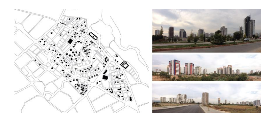
Figure 3. The indistinct urban pattern and housing estates as a result of the dominant use of FAR in development plans during 2000s.