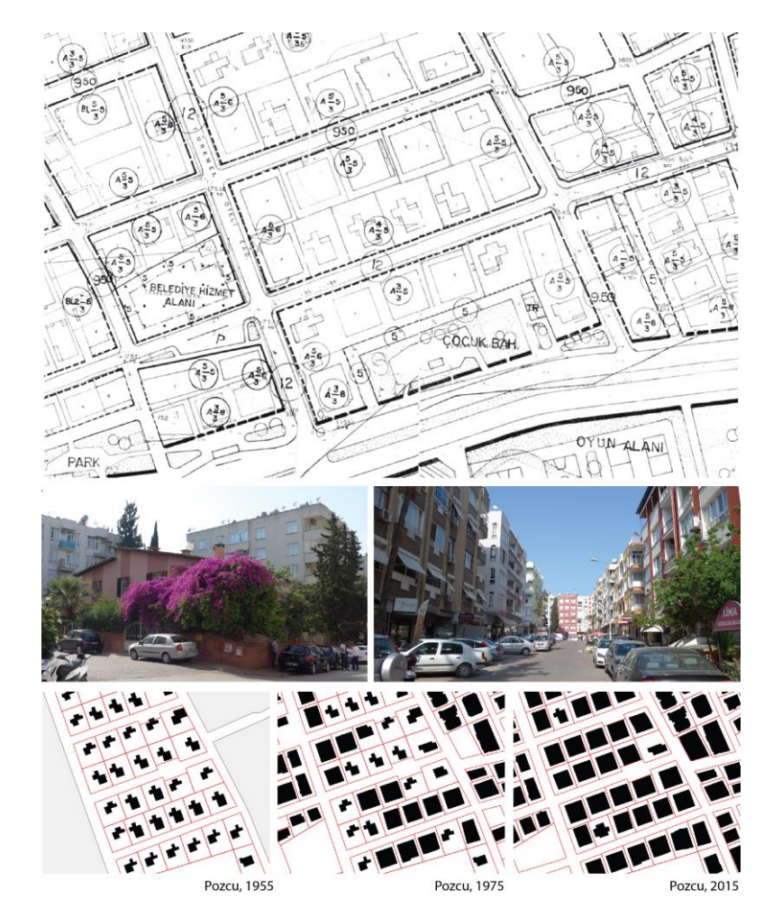
Figure 2. The apartment block began to emerge as a dominant building type in the development plans, following Republican the early period: Development plan for Mersin, 1986, a detail from Pozcu residential district and the apartment blocks that replaced the single-family houses (personal archive). The letters in the circle stand for building types (A for detached, B for attached, BL for semi-detached and row houses) while the numbers refer to the number of storeys.

Therefore, the development plans and thus planners of the period between 1950s and 1980s failed to notice the organic unity of the city that would function through the hierarchical nesting of morphological elements of urban form. The concentration was on the single building at the minor scale, and on the road network and open space system at the major scale without or little attention to how to interrelate them to each other. In the absence of interrelationship of urban form elements, creation of the urban pattern was reduced to rapid replacement of old building types with apartment blocks within the plots, created for the singlefamily houses in the previous period. Increasing building heights and coverage, and production of identical buildings led to homogenization of the urban landscape at the minor scale that resulted in emergence of 'static urban pattern'.