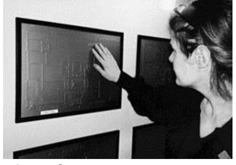
Figure 4a. Use different modes.