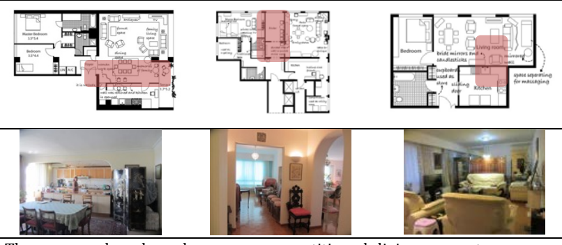
These examples show how women partitioned living room to emerge workplace. Left; Sh (Z1, clothing manufacturer) used a folding paravane to emerge a space for trying cloths and storage. Centre: De (S2, painter) separated the atelier with a wall. Right; Nil (S3, massager) used a paravane to separate the space for her work.

The main part of Sh's work (Z1, two beds) including managing and selling of the products is done at home between the kitchen and dining space. A small part in the dining area is separated using a partition and is used as the storage space and fitting room for customers. The countertop of the kitchen is her work desk where she manages her interior work as a mother and wife and her exterior work as a manufacturer. Moreover, she uses the bedroom for the storage of clothes. Del (S2, two beds) divided the living room for creating a workshop in it. She uses the second bedroom for displaying her art works as well. Zi (P1, two beds duplex) uses the corner of her very formal living room to teach piano lessons privately (Figure 3).