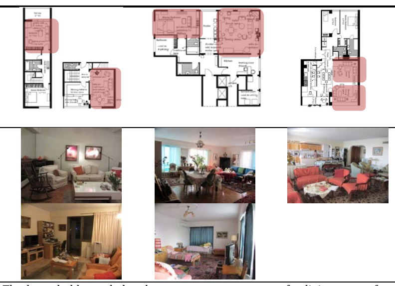
Figure 8. Intimate/presentable living rooms (Davodipad, 2017).

an open plan living room. Mo uses a decorative fir place (Z4, three beds), Sh has separate space for guests (Z1, two beds), del has a representable living room and uses the kitchen for casual friends' visits (S2, two beds). Mar has separate guest and family sitting rooms (B1, three beds). Zi separated the presentable and private living room (P1, two beds duplex), Za used bedroom as private living room (Z2, three beds) (Figure 8).