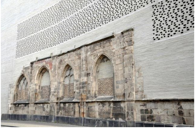
Figure 5. Kolumba Museum porus walls and transition details (URL-18, 2019)