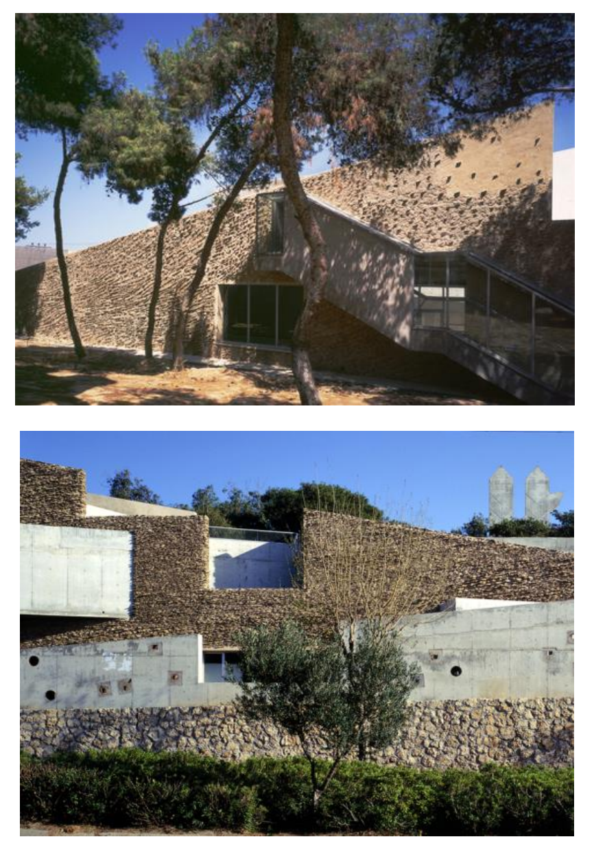
Figure 2. Palmach Museum (URL-04)

Ningbo History Museum in China can be given as another example of front / rear combination of different centuries. During the Chinese Cultural Revolution sustaining the essence of Chinese culture created an undesirable image and the term "region al" thought to be guilty. Being regional has become synonymous with limited, local and provincial. In opposition to this approach adopting the local senses and knowledge a new generation of architects emerged. Some of them, like Wang Shu and Lu Wenyu, dare to emphasise "placeness" once again (URL-05). Kenneth Frampton indicates the juggernaut they witnessed to run a studio in Hangzhou, a small country town, from Chinese modernization leaps and their impact on their own city (URL-06). Hangzhou used to be a harmonious city full of traditional features and nature, away from the conflicts of the metropolis, so was very suitable for them to live and work (URL-07).