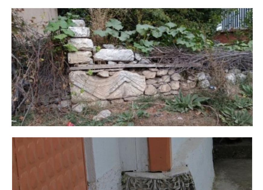
Figure 1 . Çavdarhisar

over time for a variety of reasons in the ongoing process through necessary deformation and displacement. In this practice, the complete spiritual continuity can hardly be achieved, but the proportions of the structure produced by the use of the parts, such as ornamentation or material, become part of the architectural character of the new structure. This means that in one aspect, the vitality of the structure is ensured using previous parts. However, the mixed / merged pieces provide instant notices and remain superficial since there is no continuity. Some examples of mixed/merged hybridization of different centuries can be given from the vernacular architecture of Çavdarhisar. Settled over the Aizanoi, ancient city of Phrygia, Çavdarhisar in the district of Kütahya Province in the Aegean region of Turkey uses the ruins of that period as a genuine part of their newly built structures (Figure 1).