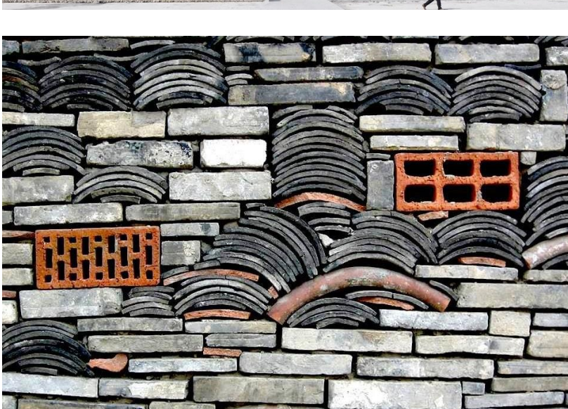
Figure 3. Ningbo History Museum (URL-10)