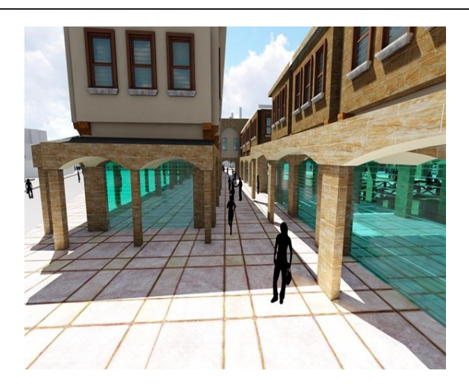
Figure 5. Traditional Texture Recommendation for Mevlana Türbeönü and its Immediate Environment. Existing Facade Texture in Mevlana Türbeönü Square.

"Mevlana Documentation Center Building" among the republican period at west of the Square has been demolished (within the scope of Transportation Master Plan) although there is no decision in the project for it with the initiative of local administration since it is on the route of light rail system. (Figure. 6, 7)