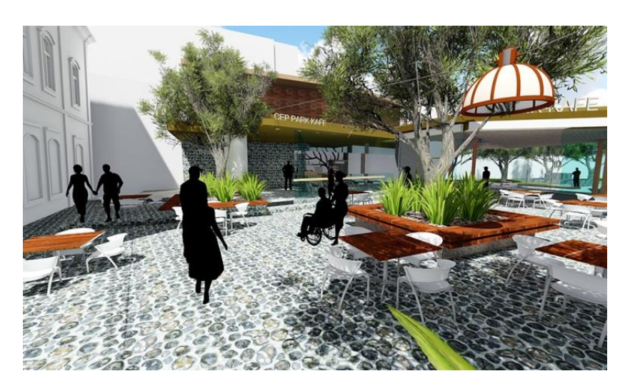
Figure 20. Mevlana Türbeönü Square/Small Park Arrangements.