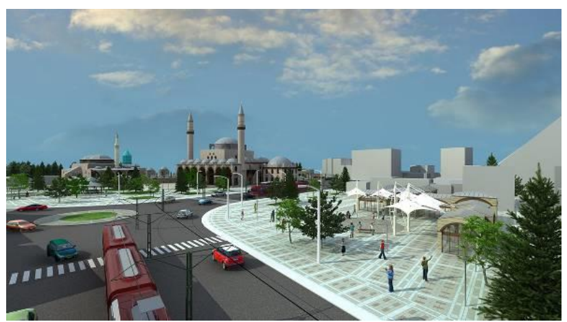
Figure 15. View of Türbeönü Square from Mevlana Avenue (Author)