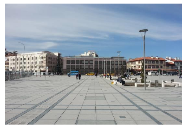
Figure 9. Provincial Culture Building Project Offered in Türbeönü Square. Mevlana Türbeönü Square.

Rearrangement has been made on the surface to the square in order to strengthen the integration of Üçler Cemetery with the square. (Figure 10) Recreation areas have been prescribed in the Square. (Figure. 11, 12, 13, 14, 15, 16.)