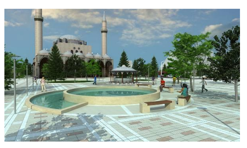
Figure 16. Selimiye Mosque in Türbeönü Square (Author)

Pavement of the Square (Green Diabase Stone), natural texture, lighting and direction of surface waters have been projected again. Aquatic/green textures in the direction of kiblah of Selimiye Mosque damaging the surface wall have been restored. Urban equipment selection and placement in the Square have been made. It has been recommended that window blinds, advertisement panels and external units of the air conditioners which cause environmental pollution on the building facades surrounding the Square are to be rearranged. (Figure. 17)