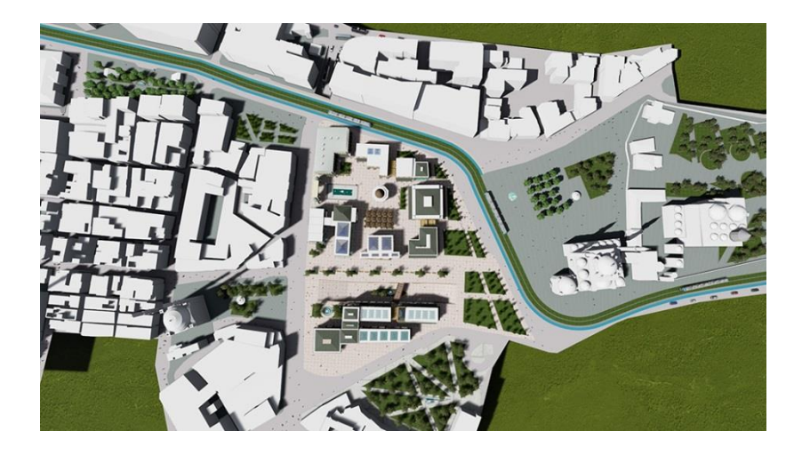
Figure 2. General Overview of Mevlana Türbeönü Square and its Immediate Environment.

Set of nonregistered old stores obscuring Aziziye Mosque region of the Square has been removed and spatial totality has been formed. Removal of Mevlana bazaar between Aziziye Mosque and Selimiye Mosque in Türbeönü Square has been left to the process within the scope of master plan. (Figure. 3) Grade differences between the road and square have been removed to ensure inclusion of Aziziye Mosque and Historical Covered Bazaar texture to the design environment of the Square. Physical conditions and functions of the stores at the border of Historical Covered Bazaar texture have been renovated. (Figure. 4, 5)