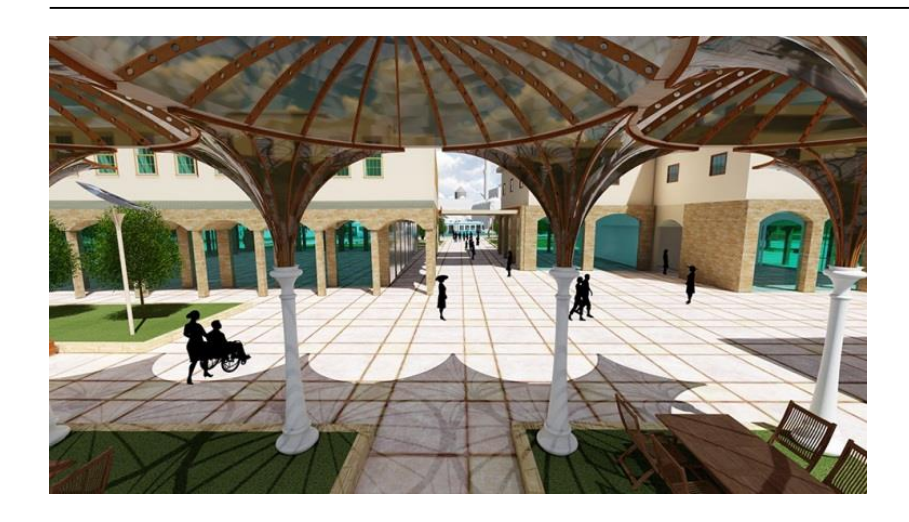
Figure 19. Mevlana Türbeönü Square/Special Planning Area 2.