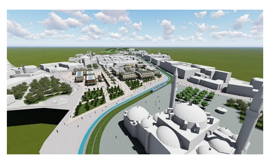
Figure 1. Mevlana Türbeönü Square/General View.

These units which will be positioned on the land of the existing public city library to be demolished will also build a barrier in front of the campuses in the back and create a sense of isolation The urban design project of Mevlana square will have a concept to meet the urban reinforcement that the city lacks (Figure 1).