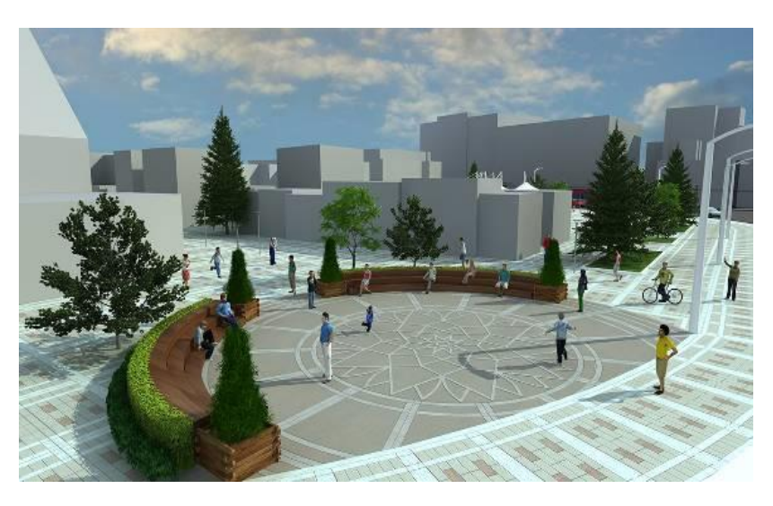
Figure 13. New Seating Elements Offered in the Design (Author) Mevlana Türbeönü Square.