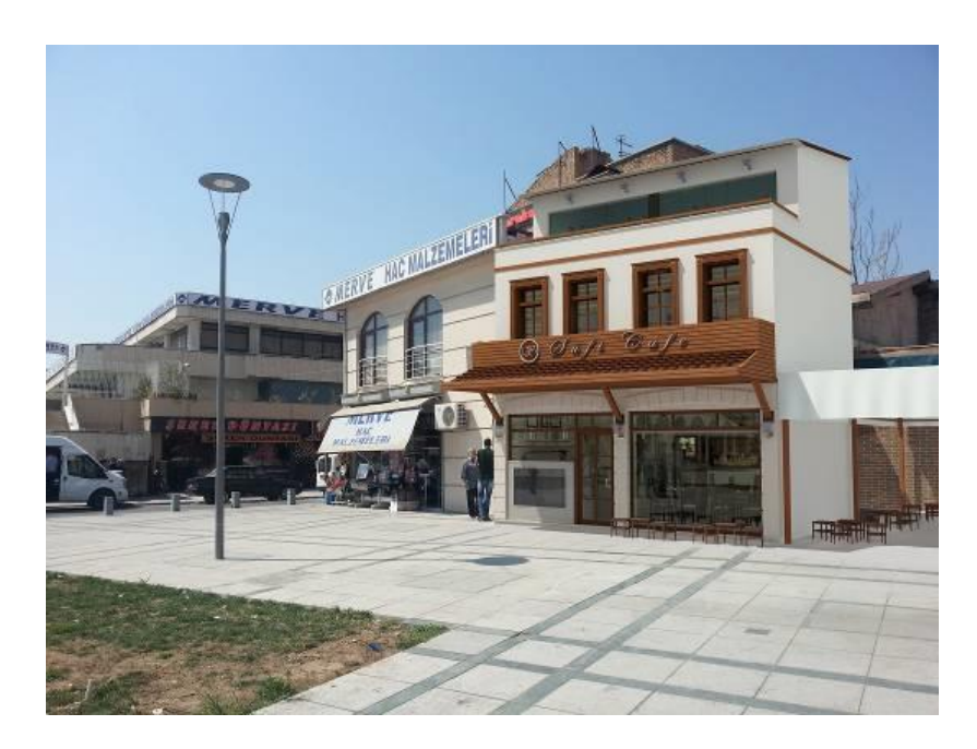
Figure 4. Improvements/Function Recommendations in the Existing Facade Texture in Mevlana Türbeönü Square.