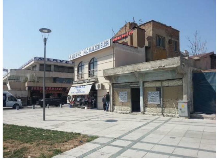
Figure 3. Mevlana Bazaar between Aziziye Mosque and Selimiye Mosque.