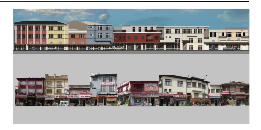
Figure 17. Facade Improvement Work on the Facade Against Türbeönü Square. (Author)

Many recommendations have been produced within the scope of this project in design of immediate environment of the Square. Primarily, a mystical trip full of sense has been prescribed for special planning area identified as "Special Project Area (ÖPA)". Existing structures in this area shall be improved and shall have functions which shall support the senses. (Structural and detail recommendations such as Private Room etc.)(Figure. 18, 19)In the similar way, side connections on the route of Mevlana and arrangements such as "Small Parks" which shall include urban memory have been considered for the immediate environment of the Square. (Figure 20)