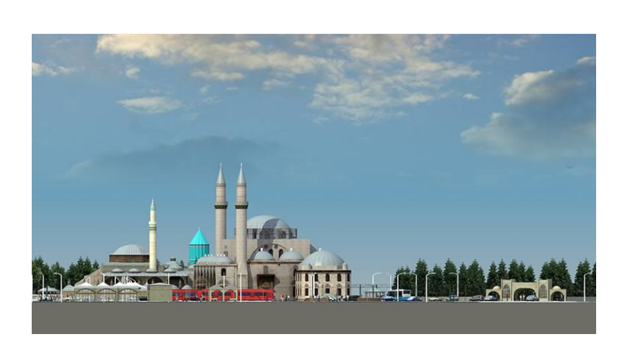
Figure 10. Üçler Cemetery Entrance Arch Offered in Türbeönü Square. Mevlana Türbeönü Square.

Rearrangement has been made on the surface to the square in order to strengthen the integration of Üçler Cemetery with the square. (Figure 10) Recreation areas have been prescribed in the Square. (Figure. 11, 12, 13, 14, 15, 16.)