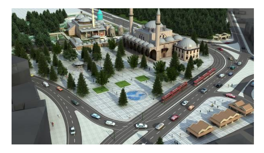
Figure 12. Alternative/Urban Design Project (Author) Mevlana Türbeönü Square.