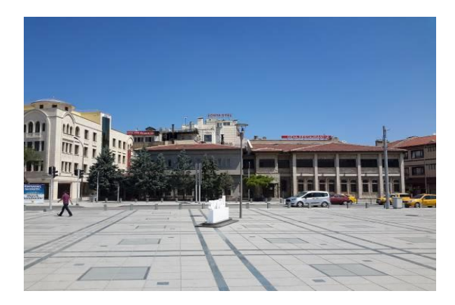
Figure 8. Provincial Culture Building in Türbeönü Square. Figure. 8. 9. Provincial Texture in Mevlana Türbeönü Square.