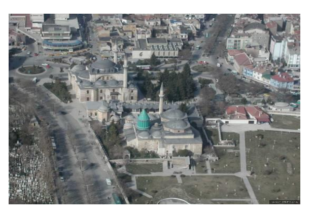
Figure 6. General Overview of Türbeönü Square. Environment. Existing Facade Texture in Mevlana Türbeönü Square.

"Mevlana Documentation Center Building" among the republican period at west of the Square has been demolished (within the scope of Transportation Master Plan) although there is no decision in the project for it with the initiative of local administration since it is on the route of light rail system. (Figure. 6, 7)