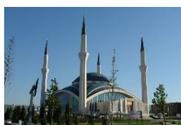
Ahmet Hamdi Akseki Mosque, ANKARA, TURKEY